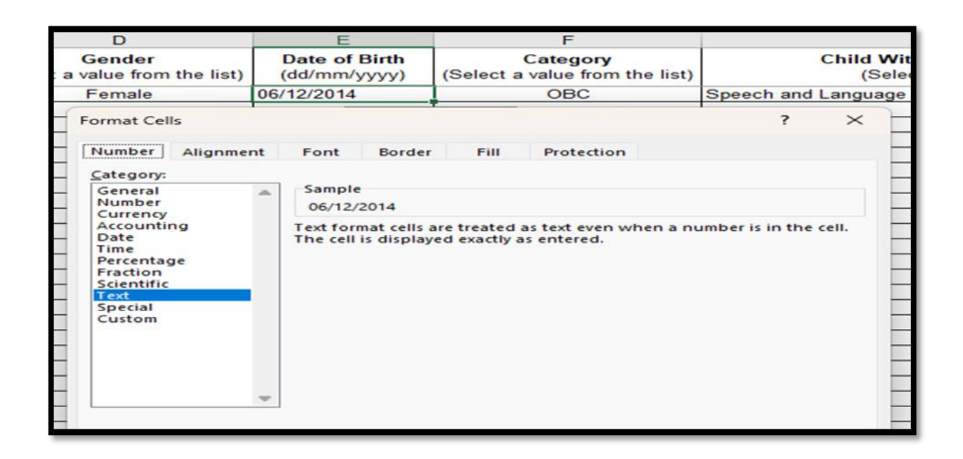
Step3 : Now ensure all date of birth column cells should be in dd/mm/yyyy format.

4. Do schools have to pay any charges/fees for SAFAL?.